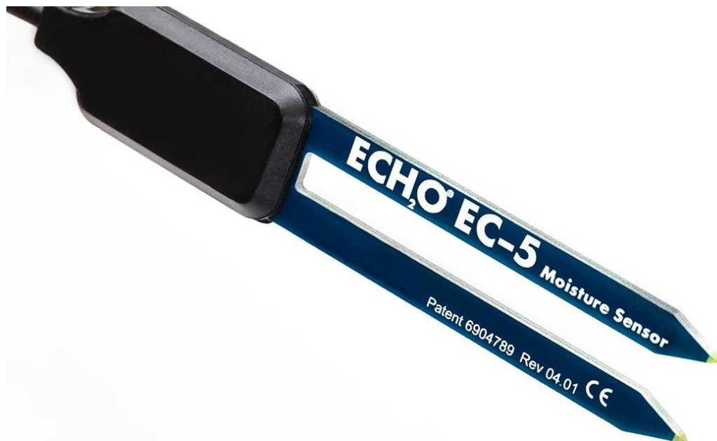
EC-5 soil moisture sensor

It appears that in the near future growers may automate irrigation using sensors to water plants efficiently and improve plant quality. The technology is currently available, and guidelines for its use are being developed. But, what's next? In the future, we wish to gain a better grasp of how water use changes depending on the location of a crop in the greenhouse (for example, proximity to cooling pads or fans), the number of plants grown, and environmental factors. An exciting new development is that the newer 5TE probes can measure both substrate EC and water content. This may allow growers to control both irrigation and fertilization simultaneously.